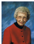
Florence B. McMullen Memorial Fund

Johnson-Downs Construction Charitable Fund