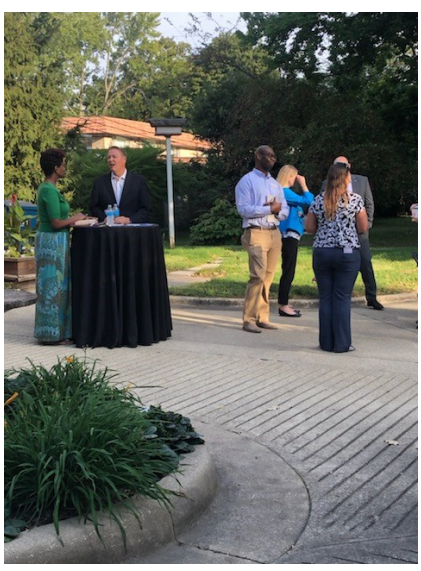
Nonprofit CEOs gathered at the Bradley House for networking and collaboration