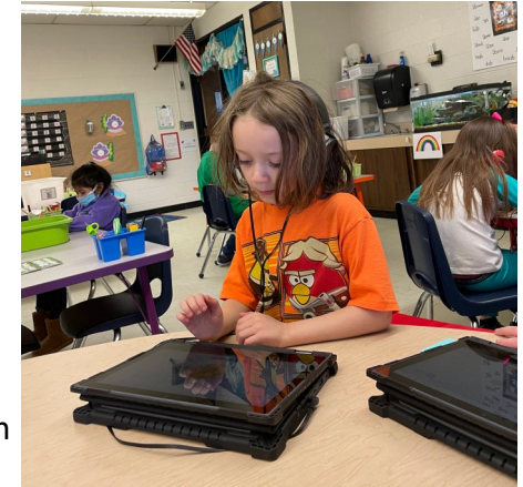
Iroquois CUSD#9 Kindergarten Student

Through the support of the Robert Dunn Grant, Iroquois CUSD#9 purchased 22 touch screen Chromebooks. The touchscreen Chromebooks have provided the opportunity for students to build a foundation of technology usage and learn math and reading skills as well. These have allowed them to learn through differentiated instruction and provided pathways of information that best meets their needs. As a result, this will help close the learning gap and put them on their way toward being technologically literate, equipped with communication, math, science, and critical thinking skills essential to prepare them for their best future.