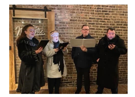
Christmas Carolers Acting out Theater Co. of Bradley, IL

Please consider taking part in this challenge by making a donation. You can donate online through our secure website, www.cfkrv.org, or send your donation to Community Foundation of Kankakee River Valley, 701 S. Harrison Ave, Kankakee, IL 60901.