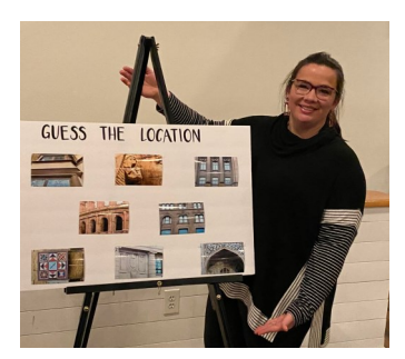
Movie & Architecture Trivia