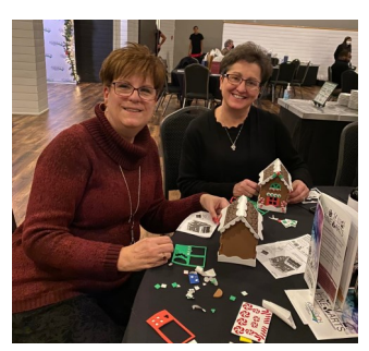
Gingerbread house building