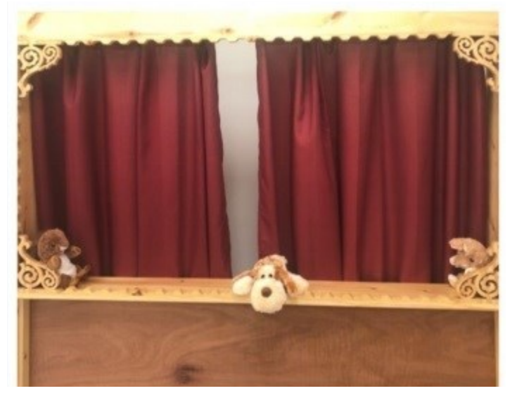
Puppet Therapy Stage used for play therapy

The COVID-19 pandemic posed new problems for their organization to deliver their mission, in a time where grieving children needed it most. The Communityworks grant helped Uplifted Care transition their service delivery methods to families to meet their needs while following state enforced guidelines.