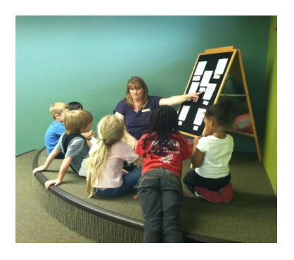
Support the literacy field by bringing authors to speak at local libraries.