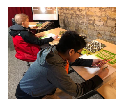
Support programs for children to learn about Architecture and the local architectural history.