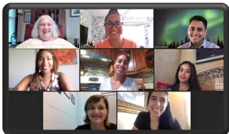
Let's Talk: Breaking the Ice on Systemic Racism Facilitators

Four "Let's Talk: Breaking the Ice" online events were designed to engage youth (ages 16-20) in conversations regarding relevant mental health issues, including Addressing the Connection Between Alcohol, Marijuana, Prescription Drug Misuse, and Mental Health; Systemic Racism; Challenges Faced by LGBTQIA+ Teens and Young Adults; and Managing Grief and Loss for Teens and Young Adults. These events reached a total of 35 youth participants.