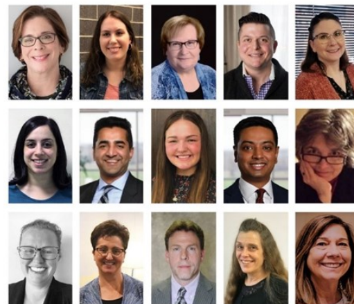
Parent Café Program Presenters

Project SUN launched a series of monthly Parent Cafés in January of 2020. These free educational events were designed to offer parents, caregivers, and other Kankakee community members a place to learn, ask questions, and make connections. After two in-person Cafés, the COVID pandemic forced the next nine events online. March was the only month a Café was not held as staff pivoted to a virtual platform. The 11 Parent Cafés in 2020 reached a total of 263 participants. The Cafés featured presentations from a wide range of primarily local resources on topics requested by parents and caregivers during Project SUN's planning year.