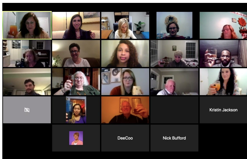
Virtual Toast at the 2020 Legacy Society Reception Zoom event.